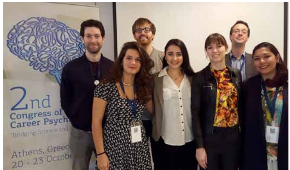
2nd World Congress of Early Career Psychiatrists in Athens, Greece, October 2016.

As part of our commitment to trainee lead research, we have now officially launched the EFPT Porto Research Award. Applications are now open for trainee lead projects working in WHO designated Europe region countries. An award will be made to the inaugural winner to recognise their success and to assist them in furthering the aims of